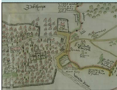
Norwich around the time of Kett's Rebellion. NRO, UNCAT.

resources are available on the teachers' packs section of the e-resources page on our new website.