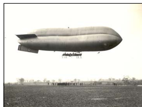
A 'Pulham Pig', Coastal Class C27 airship at Pulham. NRO, MC 2254/183.

We hope to run a number of projects with schools and will keep you updated with forthcoming projects over the next couple of years.