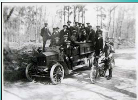
Photograph of a Charabanc. NRO, MC 2043/1/20.

The resource is now available on our website, under the teaching packs section of the e-resources page. Although listed in the Key Stage 3 and 4 Resource Packs section, the resource is suitable for both secondary and primary schools in teaching the topic. A DVD of the project can be requested from the Archive Education and Outreach Team.