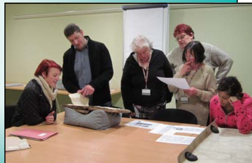
Looking at documents showing the history of Great Yarmouth.