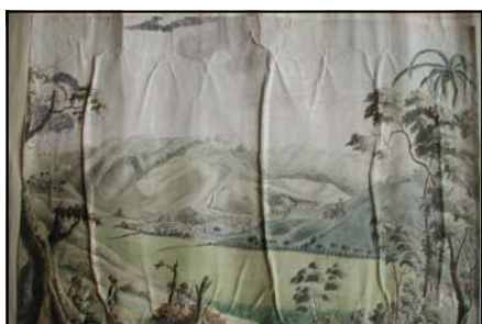
Drawing of Donnington Castle Plantation. NRO, MEA 6/27.

Once again this year we will be offering Key Stage 3 workshops on the slave trade, in conjunction with Norwich Castle Museum. During the day, costumed re-enactors will enable pupils to meet an abolitionist and a slave-ship guard, and participate in drama activities. Pupils will also look at documents relating to slave owners from Norfolk, and the role of Norfolk people in helping to abolish the trade. The workshops are available for booking for 19 and 20 June 2012. For more information, please contact Colly Mudie at Norwich Castle Museum on (01603) 493662.