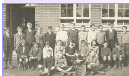
Pupils outside Tunstead School, 1928.

Since the article about our workshops to celebrate the 75th anniversary of Firside Junior School in the last edition of It's about time , we have been inundated by requests for information from a number of other schools looking into their history.