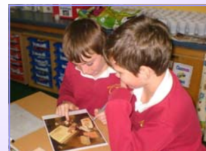
Pupils at Diss C of E Primary School looking at how to handle documents

If you still have your log books, don't forget you can deposit them with us. Please see leaflet 63 on our website for a list of school records we keep.