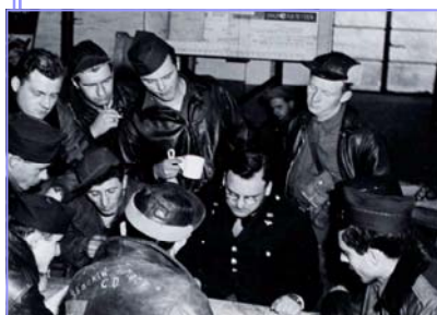
Photograph of mission de-brief.

This resource enables pupils to find out about the history of the 2nd Air Division, United States 8th Army Air Force in East Anglia during the Second World War, and the impact this 'friendly invasion' had on local people and communities. It uses documents from the 2nd Air Division Archive and artefacts from the 2nd Air Division Memorial Library, along with additional material, to look into the aeroplanes and equipment, places the American servicemen visited and where they worked, missions and incidents that occurred during the war and the differences in culture and relationships between the American servicemen and the local residents.