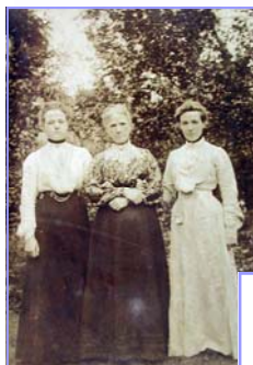
Photograph of Edith Cavell with her mother and sister. NRO, MC 304/12, 699x7

We would love to hear from schools who have suggestions on what they would like included. Please contact us using the details below.