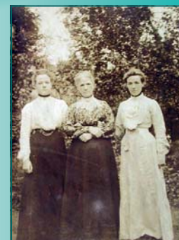
Photograph of Edith Cavell with her mother and sister.

Here in Norfolk, planning has already begun into events to commemorate this anniversary. At the Record Office we are planning school holiday activities, and an exhibition on nursing during the First World War. We are also working with Norfolk Libraries and Information Service to investigate a resource pack for schools. We are still deciding what format the resource would take and what information should be included. We would love to hear from schools who have suggestions on what they would like included. Please contact us using the details overleaf.