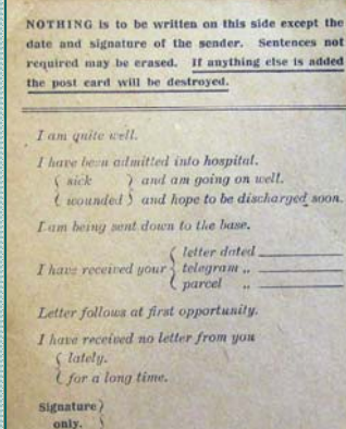
Field Service Card, 1914. NRO, MOT 111

To access the resource please visit < http://www.archives.norfolk.gov.uk/e-Resources/Teaching-Packs/ > and select Adult Education. Although aimed at adult literacy tutors the resource may be helpful to those studying English at A-level, (see article overleaf).