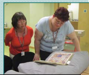
Looking at illuminated manuscripts