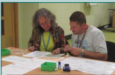
Using civil registration certificates

In July 2012, we worked with adult literacy and numeracy pupils from Great Yarmouth College for their second visit to The Archive Centre. This time, pupils had a look at how civil registration can be used to trace your family tree. Next, they made a start on working on their own family tree, by