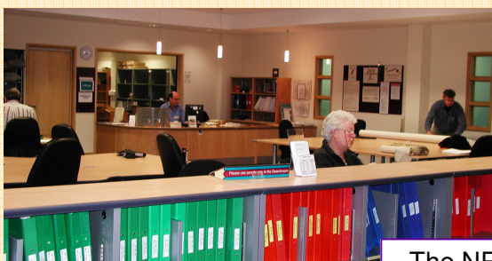
The NRO searchroom

If you would like to come in to use the Record Office for your own research, please don't hesitate to contact us. Using the searchroom is completely free of charge; staff are on hand to show you the ropes; and there is also a video available online (at http://www.archives.norfolk.gov.uk/Visiting-Us/index.htm ) which explains the process.