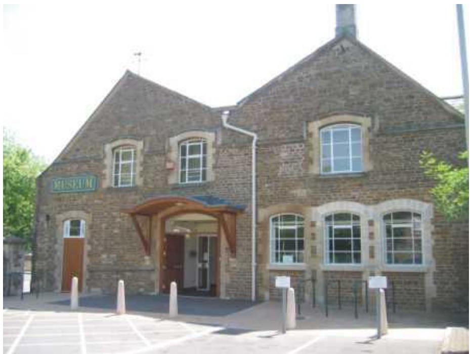
Fig.1 : the space by the entrance to Rutland County Museum where the work could be located. The existing cycle racks can be seen in the bottom right corner.

The proposals submitted for this work will be assessed by a Commissioning Panel of professional artists, members of the Rutland County Council Culture and Leisure Team, Arts for Rutland and the Project Coordinator.