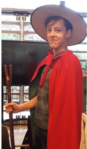
The medieval pilgrimage leader who led us from past to present on our journey in the Cathedral.

Please post your pictures after visits by following us on twitter @cathedraledu