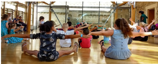
Dance & drama....this could be you!