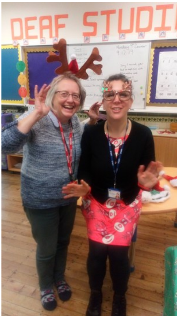
Rainbow Sparks - Music Group