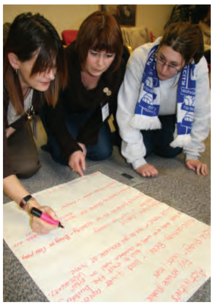
Play workers from BPCN at training day

"For example, activities like cooking are sometimes avoided in play settings due to fears about onerous risk assessments and the potential for injuries like burns. But