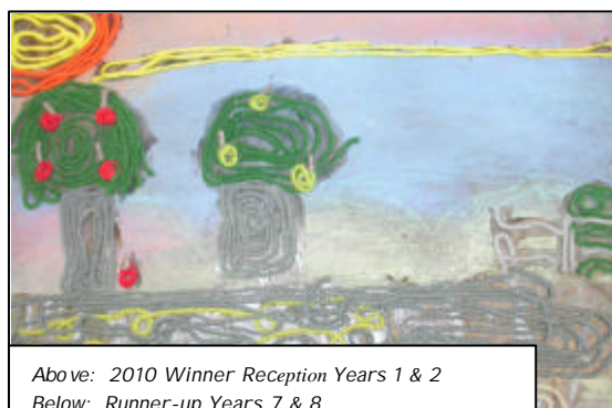
Above: 2010 Winner Reception Years 1 & 2 Below: Runner-up Years 7 & 8