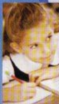
Research visit to Wroxham Primary School in Hertfordshire Focus - Creative Curriculum