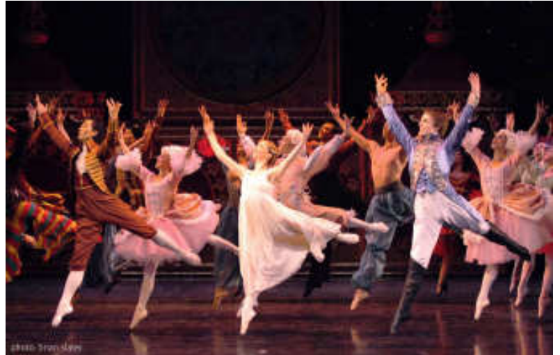
Northern Ballet's The Nutcracker