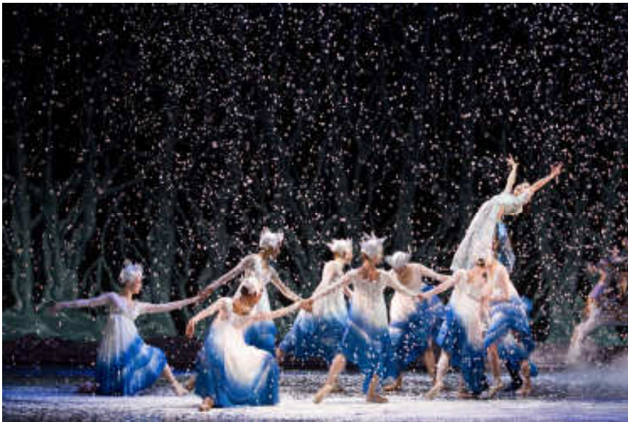
Photo: Northern Ballet The Nutcracker