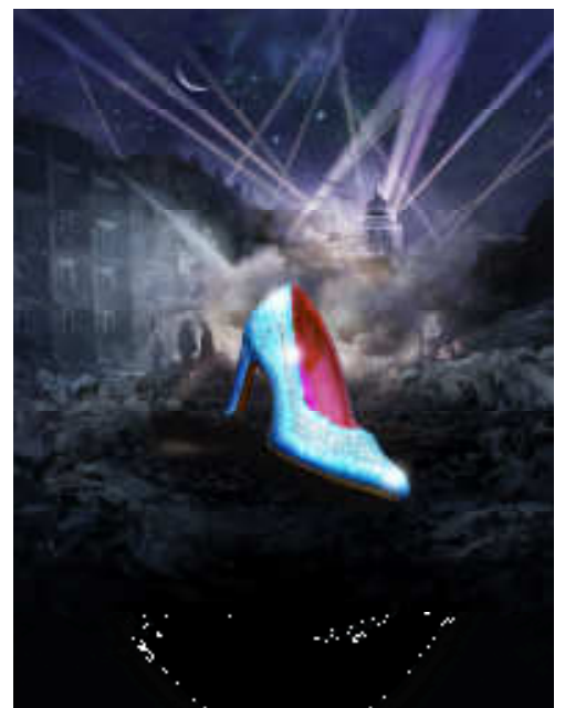
Matthew Bourne's Cinderella