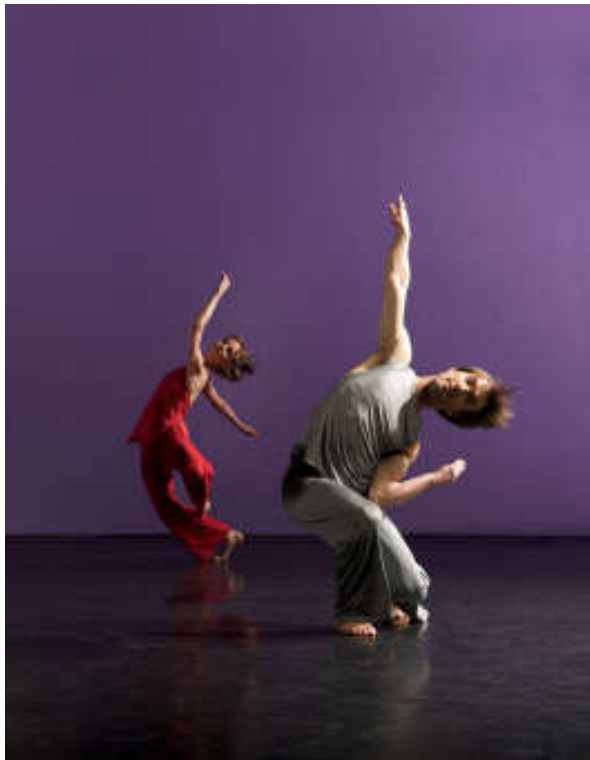
Richard Alston's Dance Company