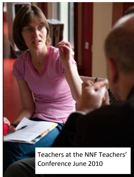
Teachers at the NNF Teachers' Conference June 2010