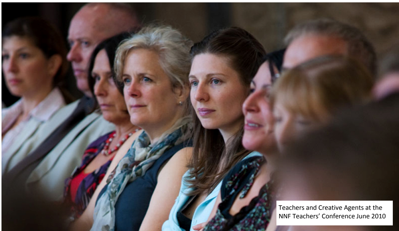
Teachers and Creative Agents at the NNF Teachers' Conference June 2010