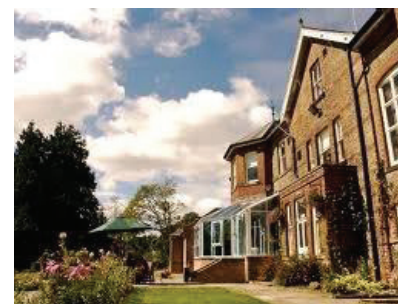
Burn Hall, just north of York: a pleasant setting for the conference