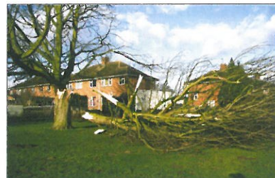
Above: Dangerous trees need inspection before it's too late!

It is not too late to sign up! Contact us for a quote for the remainder of the year.