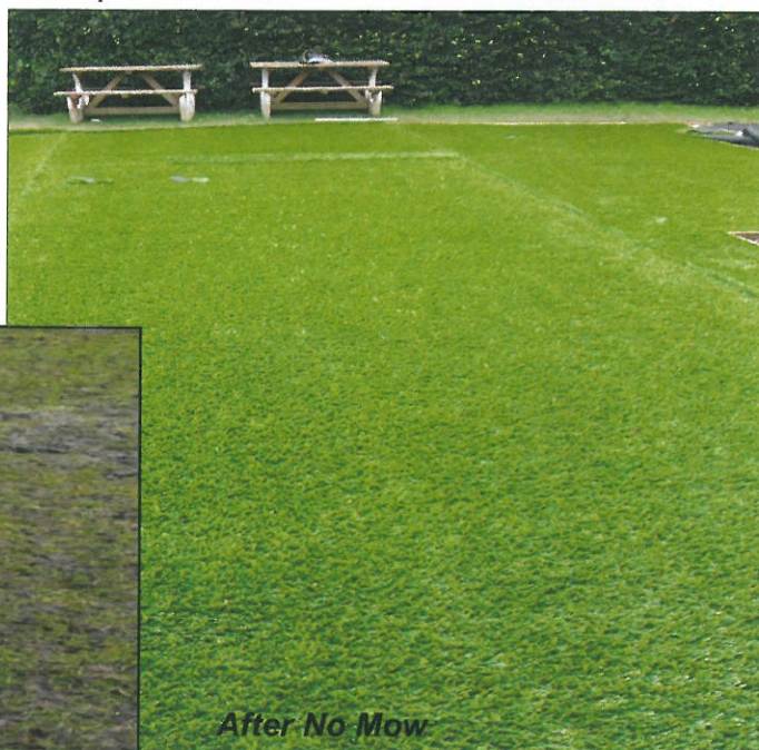
After No Mow

Synthetic 'No Mow grass' is ideal to replace worn out areas. A realistic appearance, good drainage and long lasting properties— a fantastic product for guaranteeing year round use.