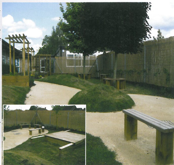
Above and right: Toftwood Infants new early years' area