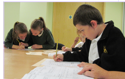
Pupils using the census to find out about past teachers

Back in the classroom, pupils wrote letters inviting people to be interviewed in September. Next, the pupils will incorporate all of the information from the documents and interviews into an archive film, which will be showcased at The Archive Centre in November, as part of the BBC's Reel History project.