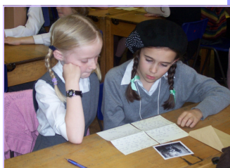
Pupils looking at the letter by an evacuee

The children follow the story of pupils from a Norwich school which was bombed during the war. Pupils look at artefacts from the war, before finding out about evacuation, using the film, along with photographs and a letter from one of the evacuees. Older pupils also get the chance to become a billeting officer, and have to find suitable housing for a list