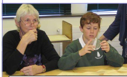
Families looking objects and insects found inside documents