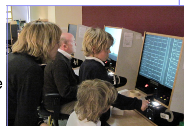
Families looking at parish registers on microfilm

Adult Education have agreed to run more of the sessions, and are currently looking for to schools interested in running sessions in Spring and Summer 2012. If your school is interested please contact us.