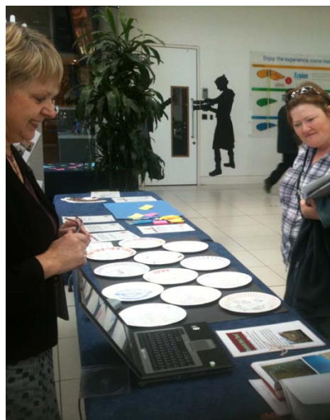
A selection of pictures showing SACRE members engaged with young people and the general public as part of 'Celebrating RE' and the 'Art of Faith' events