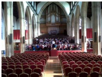
Fiddlesticks 'cellos rehearsing