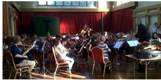
Baroque Strings rehearsing