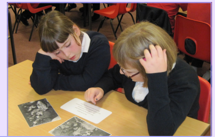
Pupils at Beeston Primary School looking at archival photographs

The school still uses its proximity to the air base in awarding the 'Liberator Cup' to the best performing pupil, and the 'Crusader Cup' to the best performing house team (so called after the nickname of the 392 nd Bomb Group), and the session helped put these awards into context. After our session, the school conducted their own