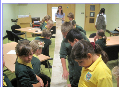
Pupils looking at a roll during their visit to The Archive Centre

we measured the modern classroom and discovered today's children have over double the amount of space that the pupils in 1880 had.