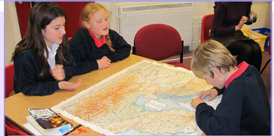
Pupils at Beeston Primary School looking at an escape map and compass

2 nd Air Division workshops prove to be a success! Last term, we advertised a number of dates for workshops run by ourselves and the Second Air Division Memorial Library. The take-up was phenomenal. The workshops booked up within three days of our advert going out to schools and we had to add further dates to meet demand. In total, we delivered eight workshops to seven primary schools.