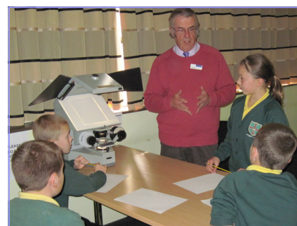
Pupils use a microfilm to view the school log-book

In October, we visited all four Year 5 classes in school. Each class had a workshop on a different topic relating to the history of the school. Topics were the building itself, the pupils, the school day and teaching staff. Pupils who looked at the school building matched an engraving of the building to 1840s plans of the school. Next, they used dimensions, taken from the 1880s school log-book, to map out the size of each of the three classrooms. Using the government recommendation at the time of allowing 8 ft 2 per child, the class worked out how many pupils would fit into each classroom. Finally,