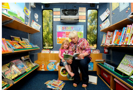
Time for a story on the SLS mobile

This year, the School Library Service Mobile has visited 165 schools, seen 11,109 children and 1,264 staff. 57,351 books have been issued and 49,379 returned. In addition it spent a happy summer holiday as the Summer Reading Challenge mobile helping to take story lab and the public library out to a variety of communities! In addition we have issued 1308 bespoke project box loans comprising approx 31,392 books or artefacts. Still very much in business then! Thanks for all your support.