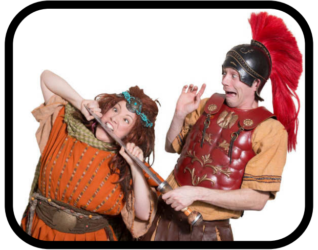
Horrible Histories ~ Barmy Britain