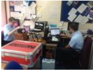
The calibrating team at work.