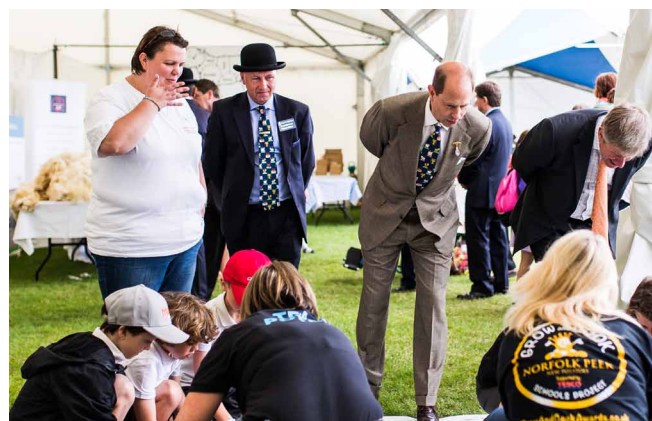
The Earl of Wessex with schools harvesting potatoes

The 2014 GYOP days at the Norfolk Showground were a huge success and the RNAA will be hosting similar events for Norfolk schools again in 2015. If you are a Norfolk school who is interested in taking part in the challenge and the Norfolk Showground Potato Days please visit www.gyop.potato.org.uk to register for the 2015 challenge and you will be contacted by the Potato Council with further details about how to apply for the Norfolk Showground Potato Days.