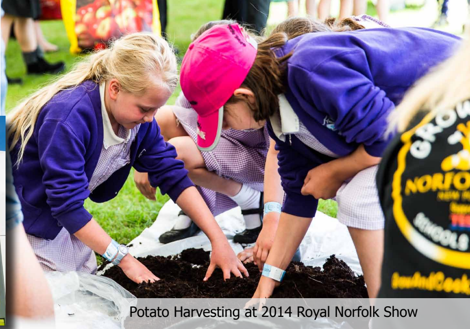
Potato Harvesting at 2014 Royal Norfolk Show