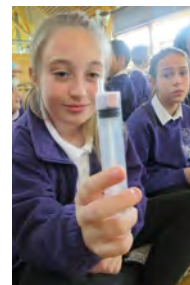
Bishop's CE Primary School