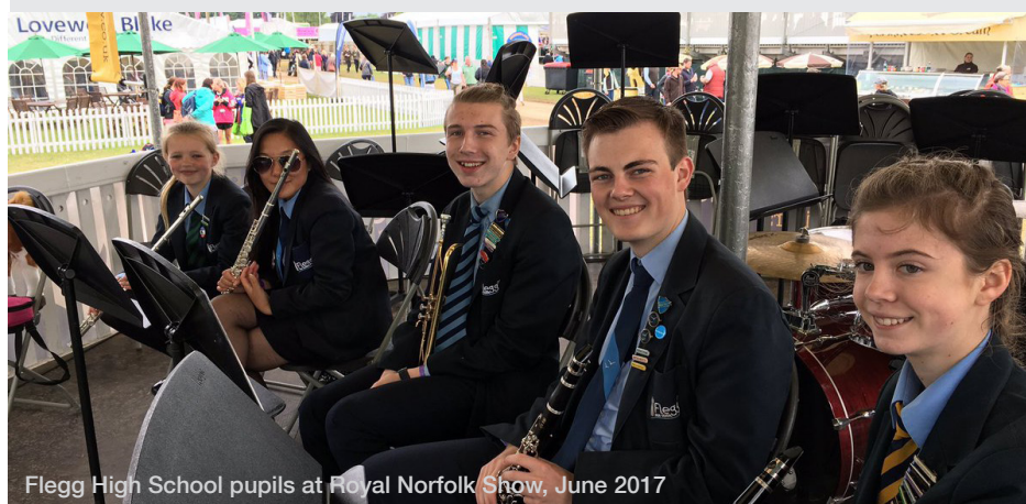
Flegg High School pupils at Royal Norfolk Show, June 2017

If you would like your school to be considered for a grant to enable teachers and pupils to work with professional musicians and music practitioners, we are pleased to announce we shall once again be offering grants of up to £1000 for projects taking place between Summer 2018 and Spring 2019. Details of how to apply are on the Norfolk Music Hub website. Applications are currently open and the closing date is 1 March 2018. Successful applicants will be notified by 31 March.