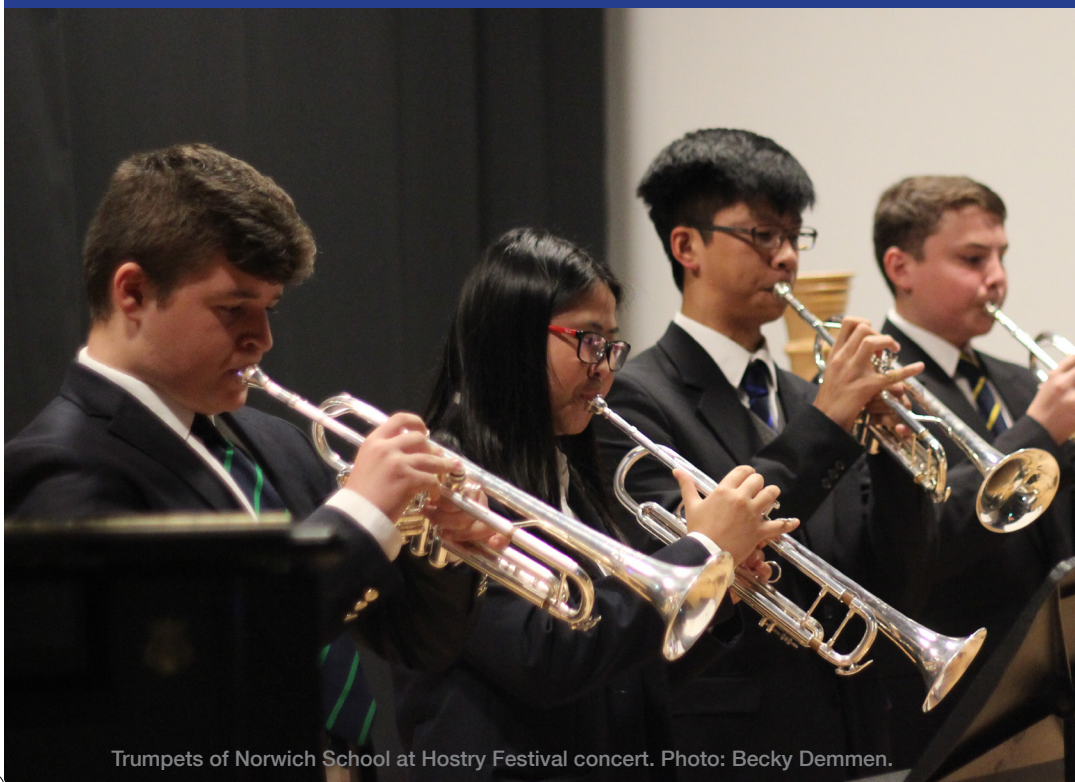
Trumpets of Norwich School at Hostry Festival concert.