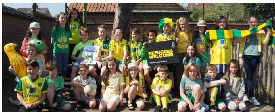
In 2018, 62 schools across Norfolk took part in the inaugural Norfolk Welcomes

To help your pupils enjoy Norfolk Welcomes, we'll send you lesson plans, assembly materials, activity suggestions and lots of stickers!