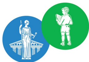
The CILIP Carnegie & Kate Greenaway Children's Book Awards

The longlists for the 2020 CILIP Carnegie and Kate Greenaway Medals were announced on 20th February, a selection of 40 whittled down from the vast list of 162 nominations published back in November.