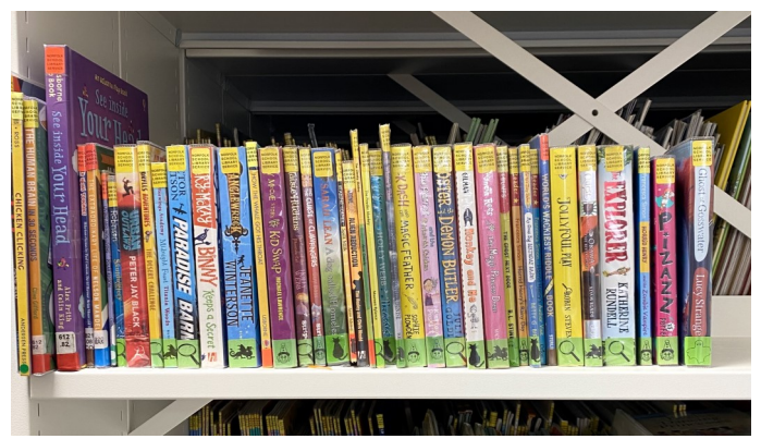
Left: 200 books with a overall value of £1548. Above: £250 worth of books!

This is where the Education Library Service can help. We offer fantastic collections of reading for pleasure books, both fiction and non-fiction titles, that will inspire your pupils to keep reading. Collections of 200 books , delivered into school and retained for a calendar year, cost just £250 . That's only £1.25 a book!