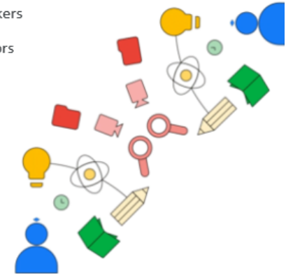
Google for Education