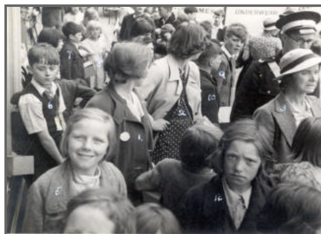
'Waiting in the market place, North Walsham, on arrival' Ref. MC631/1, 758x7

The Norfolk Record Office (NRO) is delighted to launch a resource pack in support of the study unit 'Twentieth-Century Conflicts' at Key Stage 3. It contains a selection of reproduced documents, in colour and laminated, with accompanying notes. It may be available online at a later date, but please see overleaf for further details about the pack and a form to order your hard copies. If you would like to contribute to the development of future packs and are able to join a working group of teachers at Key Stage 3, please contact me.