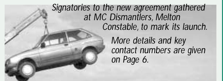
Signatories to the new agreement gathered at MC Dismantlers, Melton Constable, to mark its launch.

The County Council, District Councils, Police and Fire Service have reached a new agreement on policies and procedures for tackling the problem.