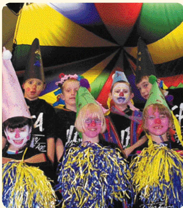
The Super Learning Week was held in conjunction with the University of the First Age.

The idea is to stimulate children's interest and enthusiasm for learning and develop a wide range of skills by presenting them with unusual and thought provoking experiences.