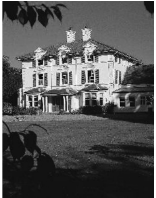
Adrian Flux's Headquarters in East Winch, Kings Lynn which has acquired Herts Insurance Consultants

For more information visit www.adrianflux.co.uk