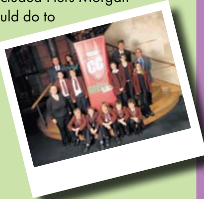
The Hellesdon High School Green SOS Team with Piers Morgan and Konnie Huq.

The pupils have issued a huge challenge to Hellesdon. Go plastic bag free by February 14th 2009!