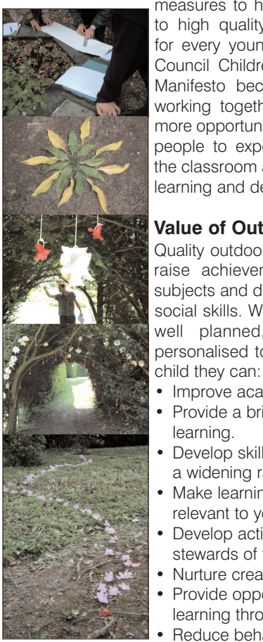
Pictures from 'Green Space Blue Sky', a Creative Partnership event in Cornwall. May 2005