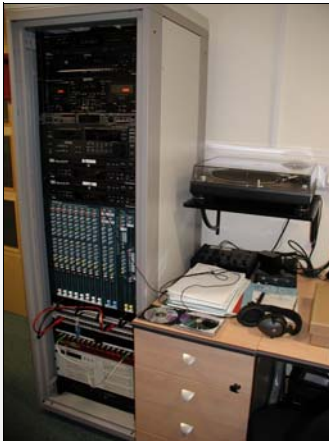
Equipment in the Norfolk Sound Archive Control Room

In recent years, many schools have started carrying out projects involving intergenerational work. Many schools have concentrated on work between pupils and elderly members of their local community. This could take place in the form of a question-and-answer session involving the whole class, or as an interview involving only a small number of pupils. However, if your school wishes to carry out the work, children find it fascinating to talk to adults about their differing experiences.