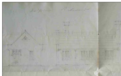
Walpole St Andrew Church of England School, Building Grant Plan, 1848 Ref: P/BG 122

The Norfolk Record Office has received funding for a project working with three primary schools in the west of Norfolk. One teacher from each school will spend two days on placement at the Archive Centre in Norwich. They will work closely with NRO Education and Outreach staff to choose documents relating to their local area. Once the documents have been selected, the teachers will take copies of them back to their classroom to use as resources for a number of lessons. The project will be completed by March 2006, after which we plan to launch a booklet providing details and an evaluation of the project, along with examples of pupils' work. Look out for details of the launch in later editions of this newsletter. Although aimed at Primary Schools, this project may be of interest to teachers of year 8 and 9 pupils. We plan to keep you up to date on the developments of the project in later newsletters.