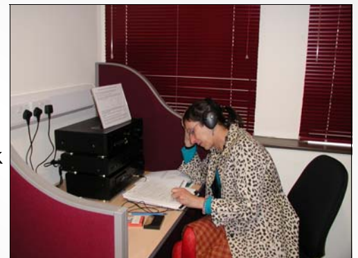
The first visitor to the Norfolk Sound Archive, after it opened to the public in May 2005.

loaning recording equipment. If you would like to record pupils at your school, interviewing elderly people as part of an oral history project, then get in touch with our Norfolk Sound Archive Staff on (01603) 222599.