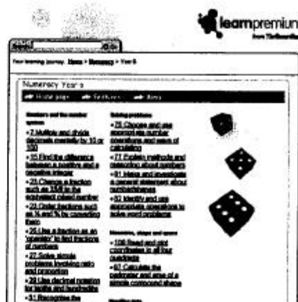
Numeracy and Literacy