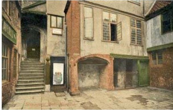
Strangers' Hall, 1900.

Come and find out by investigating with us the Bolingbroke family – owners of Strangers' Hall in the Victorian era.