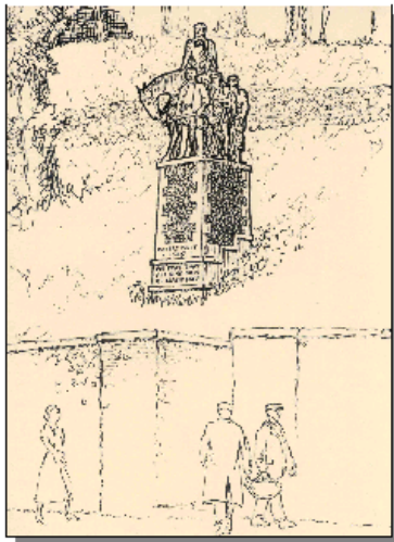
Proposed memorial to Robert Kett, 1948

Greetings from the Archive Education and Outreach department! After a well deserved break for Christmas and the New Year, it is now time to settle into the spring term. We hope that the information in our newsletter will be of help over the next term. However, if there is anything else we can do, please feel free to contact us. Our address, e-mail and phone number are on the back of this newsletter.