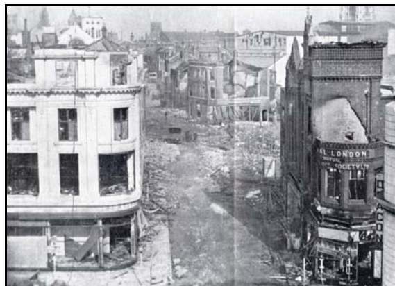
Photograph of Rampant Horse Street, 1944-1945 Ref. N/TC 57/37

This resource pack contains fourteen laminated, reproduced documents with accompanying notes for teachers. The documents focus on three major conflicts of the twentieth century - the First and Second World Wars and the Cold War. They allow pupils to examine key ideas and themes and to compare and contrast wartime experiences of people in Norfolk. Letters (both transcribed) written in 1916 and 1942, for example, relate the bombardment of Caister by the German Imperial Navy and the impact of the Blitz in Norwich respectively.