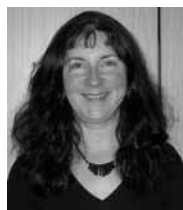
Parent Partnership Support Worker