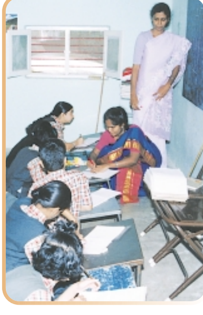
Classes include children with various disabilities

I am grateful to OC Team for handling the finances for this project, co-ordinating the reporting of the project to supporters and for their invitation to share this project with you. I would like to invite readers of this newsletter, whether individuals, trusts or churches, to join with us in the Norwich Diocese to sponsor this project.