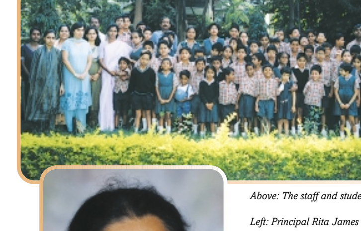
Above: The staff and students of Asha Kiran

other crafts, drawing, painting, nature study, and PE. The older children study business studies.