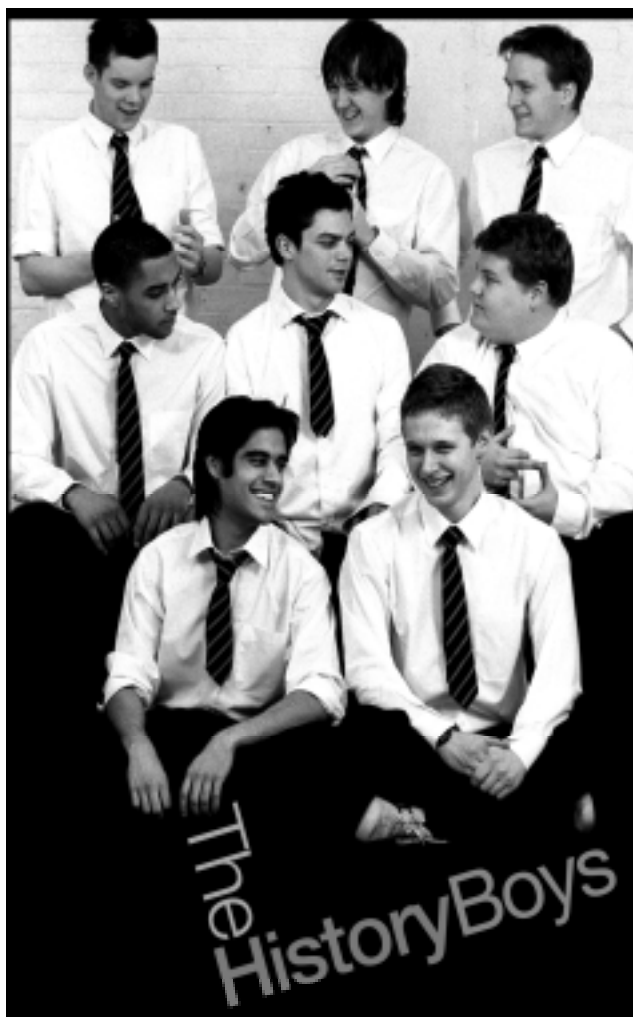
Photo of The History Boys (the cast from the original company) Ivan Kyrnd See inside for further details of this production

THEATRE ROYAL ~ Backstage Tours Work Experience Risk Assessment