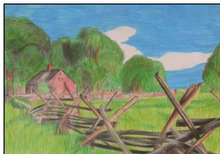
Winner Years 9 & 10