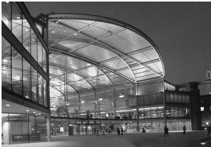
Pride of Norfolk: The Millennium Forum