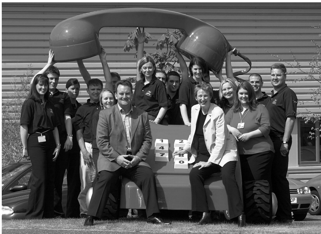
Ringing success: Celebrating Direct Line's New Current Account mortgage