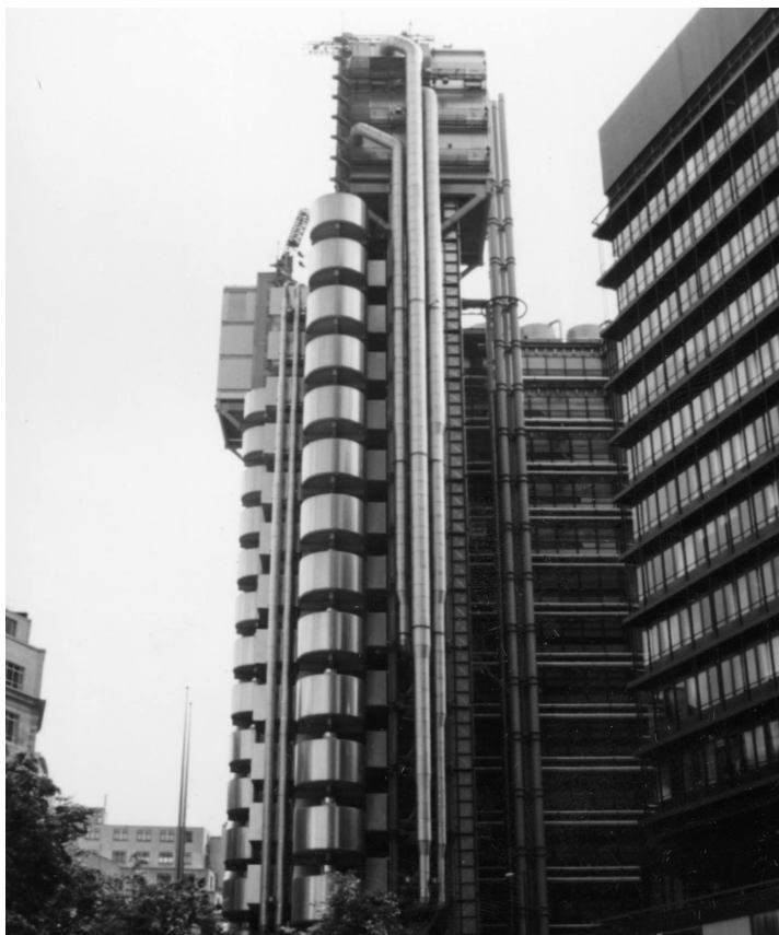
Landmark: Lloyds of London

After visiting the two most prominent financial institutions in London, the party returned by coach having fully enjoyed a most interesting day in the capital. Our grateful thanks go to the staff at both Lloyds and the Bank of England for receiving us in such a hospitable fashion.