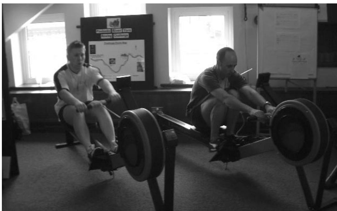
Challenge: Rowing without leaving dry land