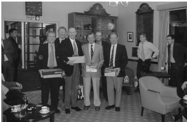
Sweet Charity: Participants at the Charity Golf day