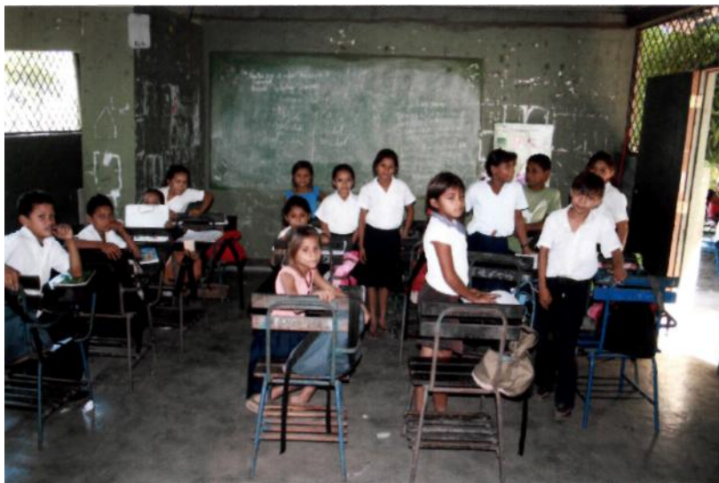
A typical rural school in El Viejo. This one is in a very remote and scattered area, no electricity, few books and equipment and not enough teachers.