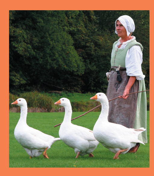
Late June/early July or late September each year