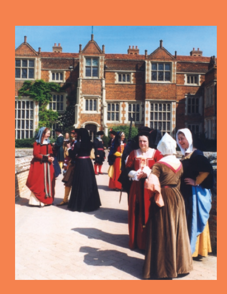
Re-Creations of Everyday 16th Century Life