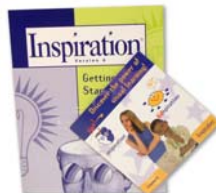
Mind mapping software