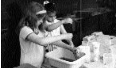
Children enjoying one of the Sainsbury Centre's Workshops.