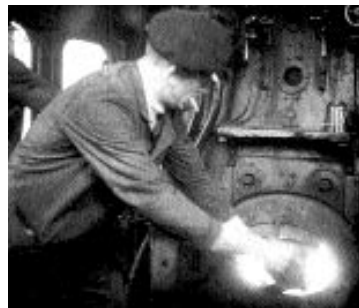
Railway Film