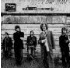
Toploader 15 November, at UEA