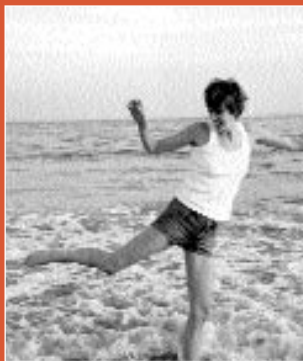
Beth Orton, live at UEA 16 October See Gigs on Campus, page 2