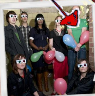
Bearsuit HCS 08