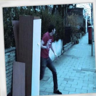
Hot City Sounds, Norwich Arts Centre 3 July: with The Kabeedies.