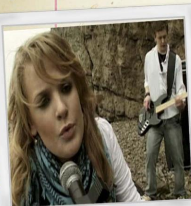
Hiflyer - "Chasing Rainbows"