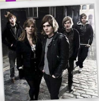
Kill it Kid: Waterfront, 9th July