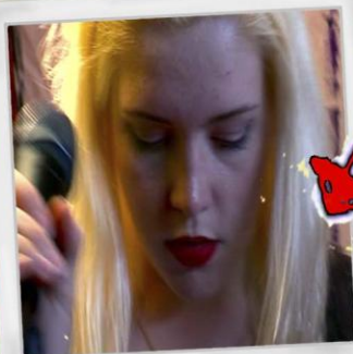
The Brownies - "Dance Romance"