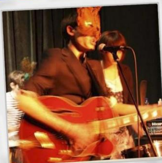
Tawny Owl and the Birds of Prey...