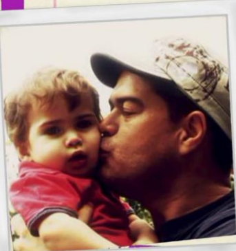
Dinky Loop - "Kiss ya Better"