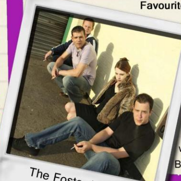
The Foster Kids: B2, 11th July