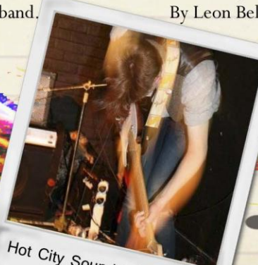
Hot City Sounds, 9th July...