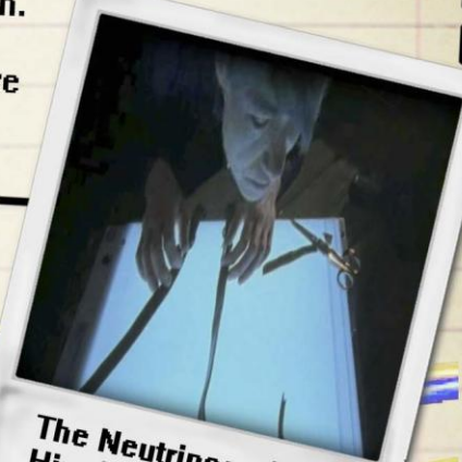
The Neutrinos - 'Build Him 'til He Breaks'