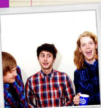
Hair Traffic Control: B2, 6th July