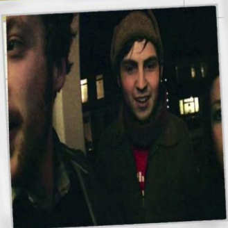
BBC Norfolk Music Video Festival, 29th June - 11th July: 'Your Elbow'.