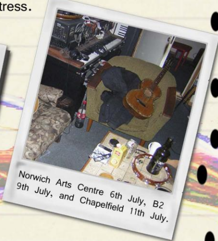
Norwich Arts Centre 6th July, B2 9th July, and Chapelfield 11th July.

It was a liberating experience - performing to an audience without microphones in your face or the unavoidable affectedness that comes with being on stage.