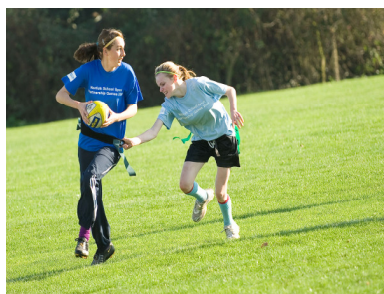
South Norfolk girls' rugby player makes a break and goes onto score. South Norfolk went on to win the Girls Rugby overall – well-done girls!

Norfolk County Council was delighted to have been a major funder of this event yet again. The sun shone and the smiles said it all. Competition was fierce this year and all the young people wanted their School Sports Partnership to be the winners