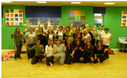
Some of the delegates at the end of a fantastic CPD session focussing on the Early Years

This course was delivered by an enthusiastic and experienced tutor from Val Sabin Publications, who are responsible for the Action Kids Programme. Delegates explored a range of activities designed to help deliver the early learning goals and lay firm foundations for children's physical development, including focussing on the links to writing, manipulation skills, tracking and reading.