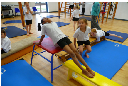
Pupils and teachers at work on a Gymnastics apparatus course.

Through our evaluation process we have been rated 100% for the quality of our tutoring and overall satisfaction of our work. Since September we have run .... Courses in a variety of areas including swimming, OAA, Gymnastics, NQT support (primary and secondary) and Early Years.