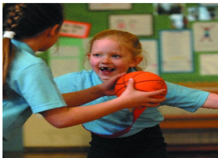
An example of what we are looking for

**WIN a Digital Camera for your School**